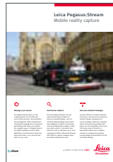
Leica Pegasus:Stream Mobile reality capture

Illustrations, descriptions and technical data are not binding. All rights reserved. Printed in Switzerland – Copyright Leica Geosystems AG, Heerbrugg, Switzerland, 2015. 836097en – 06.16