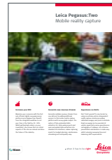
Leica Pegasus:Two Mobile reality capture