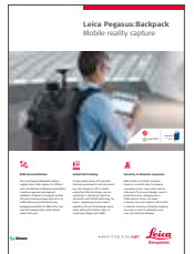
Leica Pegasus:Backpack Mobile reality capture

Leica Geosystems AG www.leica-geosystems.com