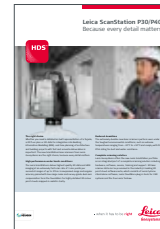
Leica ScanStation P30/P40 Because every detail matters